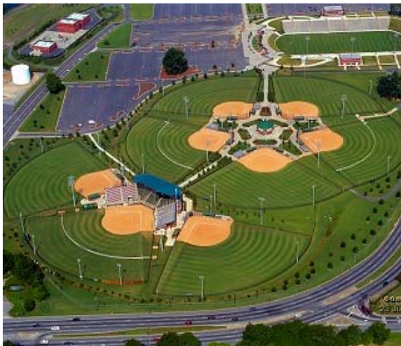
The beautiful South Commons Softball Complex of Columbus, GA will host the 2013 NCSA World Series Tournament. The complex boasts seven separate fields as well as one stadium within its bounds.

With the NCSA World Series set to return to Columbus, Georgia again in 2013, The National Club Softball Association is proud to display the 2013 tournament logo. The South Commons Softball Complex in Columbus will play host to the NCSA World Series from May 17 th to the 19 th , 2013. Sixteen of the top NCSA teams will compete in Columbus, Georgia so that one may be crowned the National Champion.